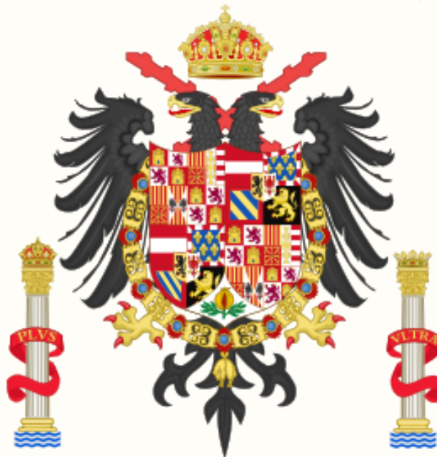
The Coat of Arms of Charles V

In the early days of his reign in the 1520s, Charles faced many challenges when learning how to effectively balance his empire being seen as too Burgundian by many of his subjects. The 1520s saw many revolts in Charles' lands; The Revolt of the Comuneros in Spain saw groups of Castilians both nobles and peasants attempt to overthrow Charles and place his Mother Joanna on the throne. Additionally the Revolt of the Germanies, an anti-monarchist revolt spread in the Kingdom of Valencia.