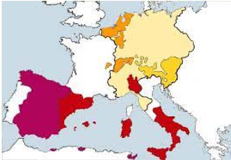
Lands held by Charles V