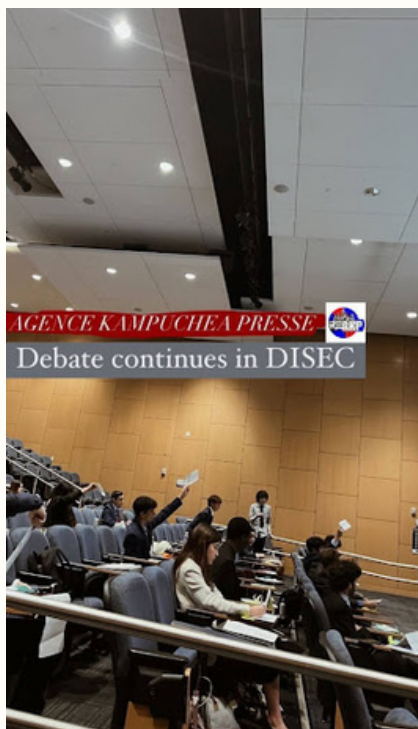
Instagram story by Agence Kampuchea Presse (AKP) depicting the ongoing debate within the DISEC committee room

Article written by NotiMex on the Pacific Island Forum discussing the ongoings of the room and the resolutions being discussed.